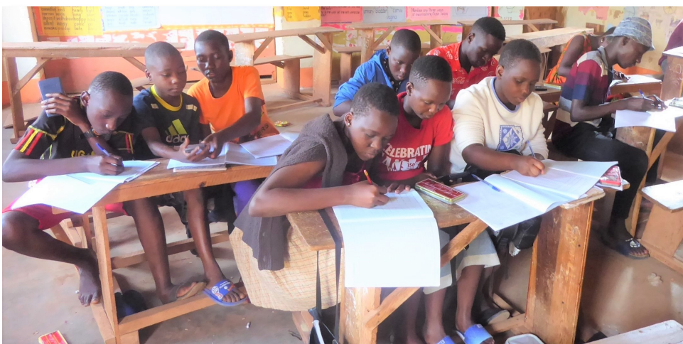
High school students eagerly attend math lessons that we offered during the long school break.

We welcome donations of any amount. You can also help by organizing a fundraising event in your church, school, office, Sunday School, or organization on behalf of the children of Uganda.