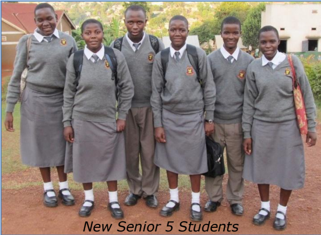
New Senior 5 Students

our S4 graduates were accepted into Mengo Senior School. Combined with two returning students and two new students in Senior 1, this doubles our total 2013 enrollment at Mengo S.S. to ten.