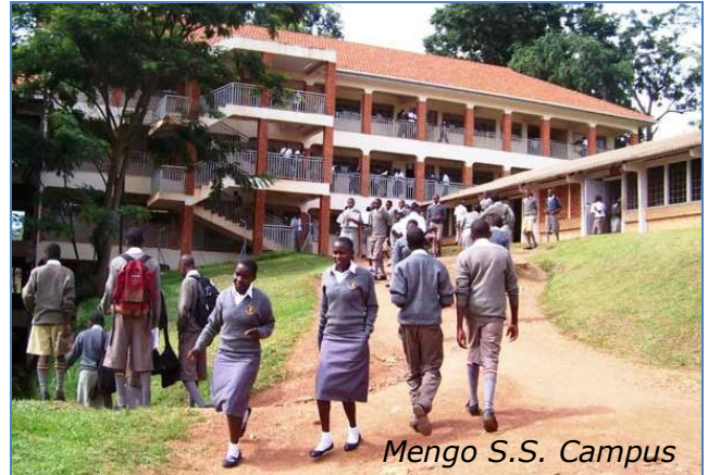
Mengo S.S. Campus